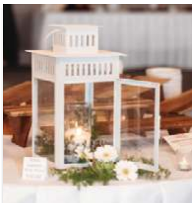
WHITE LANTERN WITH DÉCOR